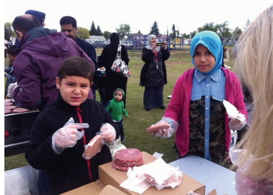
Hamburger preparation for community BBQ